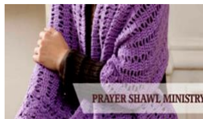
PRAYER SHAWL MINISTRY